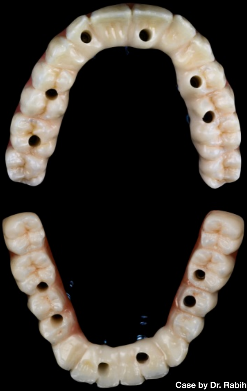
Clinical Case: Full zirconia all-on-6 dentures